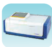
UV/VIS Spectro 2080+ Double Beam

Analytical Technologies is synonymous for offering technologies for doing analysis and is the Fastest Growing Global Brand having presence in at least 96 countries across the global. Analytical Technologies Limited is an ISO:9001 Certified Company engaged in Designing, Manufaturing, Marketing & providing Services for the Analytical, Chromatography, Spectroscopy, Bio Technology, Bio Medical, Clinical Diagnostics, Material Science & General Laboratory Instrumentation. Analytical Technologies, India has across the Country operations with at least 4 Regional Offices, 6 Branch Offices & Service Centers. Distributors & Channel partners worldwide.